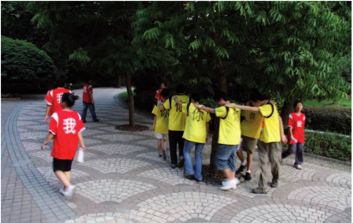
Ricardo Basbaum, me-you: choreographies, games and exercises , 2008, performed at the 7th Shanghai Biennial.

to produce sense, the artwork should (not exclusively, of course, this is just one possible account of the problem) be addressed by the informe , by the idea of gaming (not game theory, but an area related to the history of games in culture and politics) and by the political frame of a bio- or micropolitics. Respectively, such a blurring of formal and previously established categories, as well as the maintenance of a space for open conversation and the public problematisation of subjects and bodies, would make the problem of producing art in a participatory mode productive in terms of establishing lines of resistance against instrumentalisation and other forms of manipulative appropriation. Artists like Oiticica and Clark, but also David Medalla, Antônio Dias, Luis Camnitzer and Cildo Meireles, for instance, helped (in different modes and by different strategies) to build the thickness of this contact zone, allocating responsibility to the viewer and establishing the double aggregate 'body subject + work of art' as an unavoidable feature of the contemporary.