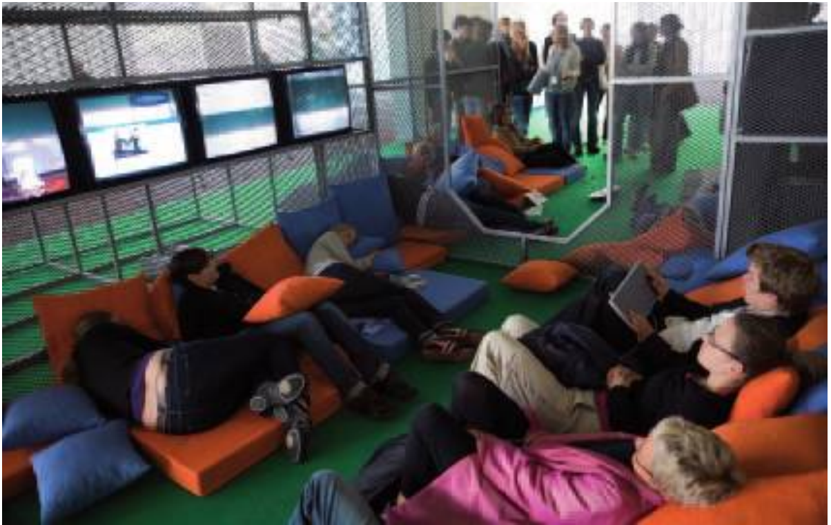
Ricardo Basbaum, Would you like to participate in an artistic experience? , 1994—ongoing, painted steel structure, wire mesh, painted steel object, carpet, mattresses, cushions, 8 monitors, 2 DVD players, 4 computers, 8 closed-circuit TV cameras, 2 closed-circuit systems, wall diagram, wall text installation: 2000 × 960 × 240cm. Installation view, Ave Pavilion, documenta 12, Kassel, 2007.

critical and intellectual value with contemporary practice — as well as indicating the strength of the interests and actors (institutions and artists, but also banks and other international finance and communication companies) that continue to align themselves with the topic of ‘participation strategies’. Clearly, it was important to stress that an artistic, critical and intellectual compromise should prove viable and suitable for strategies of resistance (still to be further explored, of course) before the subject would become generally dispersed through the interests of the new cultural economy. The rapidity of the alignment between art and neoliberal practices also indicates how ambiguous the connections have been between both the Concrete and Neoconcrete artists’ heirs 10 and the current art market — because it is in fact almost impossible to make work for both the